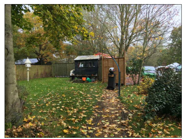
Looking north towards timber shed