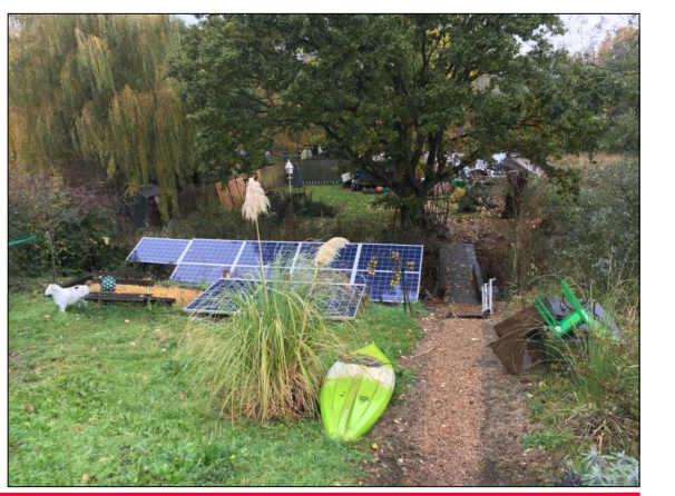
Looking north at solar panels