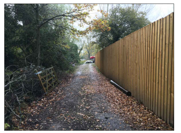
Looking south along access track with new 2.45m high fence on right.