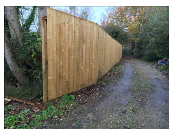
Looking north along access track with new 2.45m high fence on left