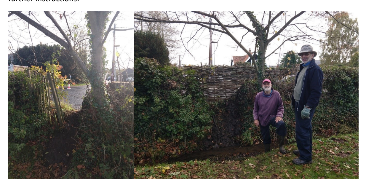
Figure 1 Before Figure 2 After

There may be some planting to be done as a result of the Hall Farm Road Sports Ground consultation and will await further instructions.