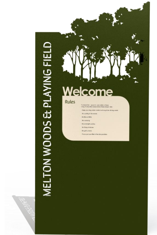
Main front view

Laser cut from stainless steel for corrosion resistance & longevity (will not rust). Powder coated to add colour. Designed to bolt to a submerged / ground levelled concrete slab.