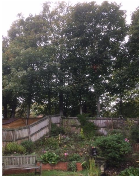
Photos of the two Sycamore Tress